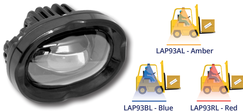
LAP93AL - Amber

Linear boundary lights available in amber, blue and red.