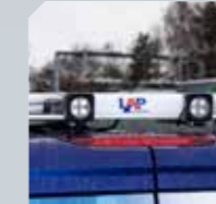
External LED Work Lamps