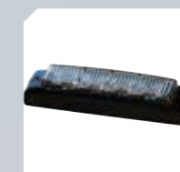
Front & Rear Hazard Lights