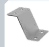
100mm & 150mm Z Shaped Brackets