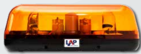
CLB55SA & CLB55TA 400mm compact rotating lightbar also available (see page 59).