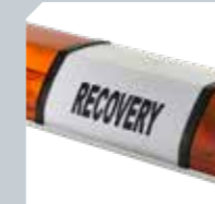
Opaque/Illuminated Centre & Signage