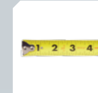
Lengths from 2ft to 6ft