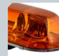
Two or four LED head options