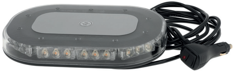
Model shown: LAP0930AC/MAG

The economical low profile LAP0930 range provides ultra bright hazard warning with 30 x 1W amber LEDs.