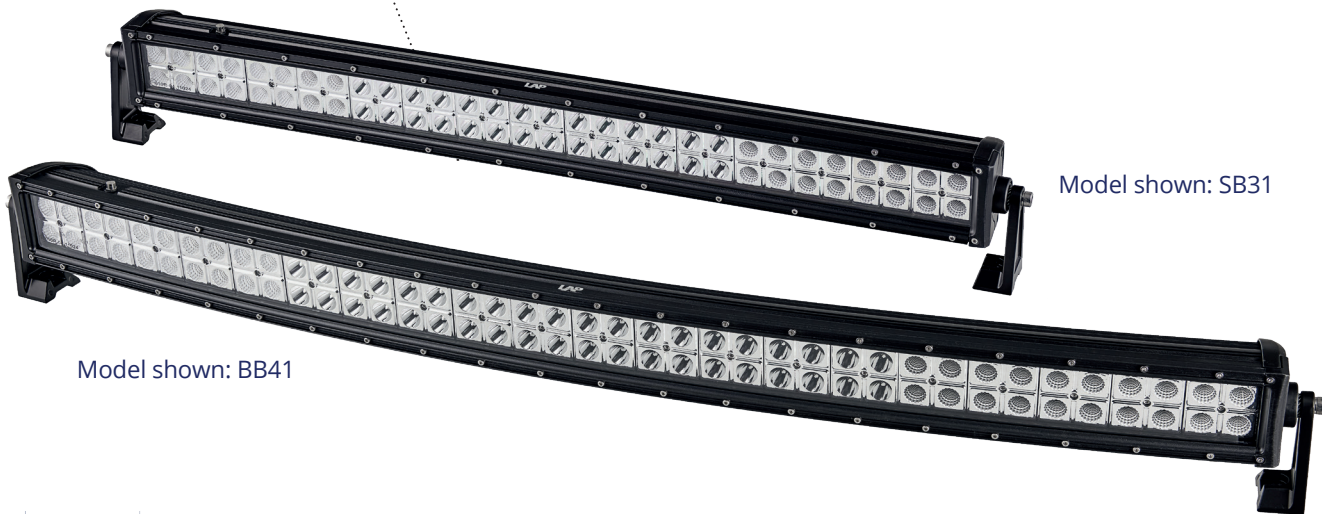
Model shown: SB31