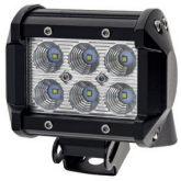
Model shown: SB04

Our range of straight and curved LED work light bars are manufactured with ultra-bright 3W LEDs giving an impressive working light that can be angled to your exact requirement. Available in 6 different lengths, the SB & BB work light bars provide a large, well illuminated working area.