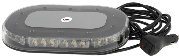
Model shown: LAP0930AC/MAG

The economical low profile LAP0930 range provides ultra bright hazard warning with 30 x 1W amber LEDs.