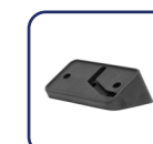
63201855 30° rubber mounting bracket available