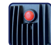
On/Off Switch Manufactured with on/off switch